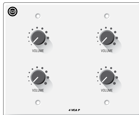
Figure 2. 4-VCAP